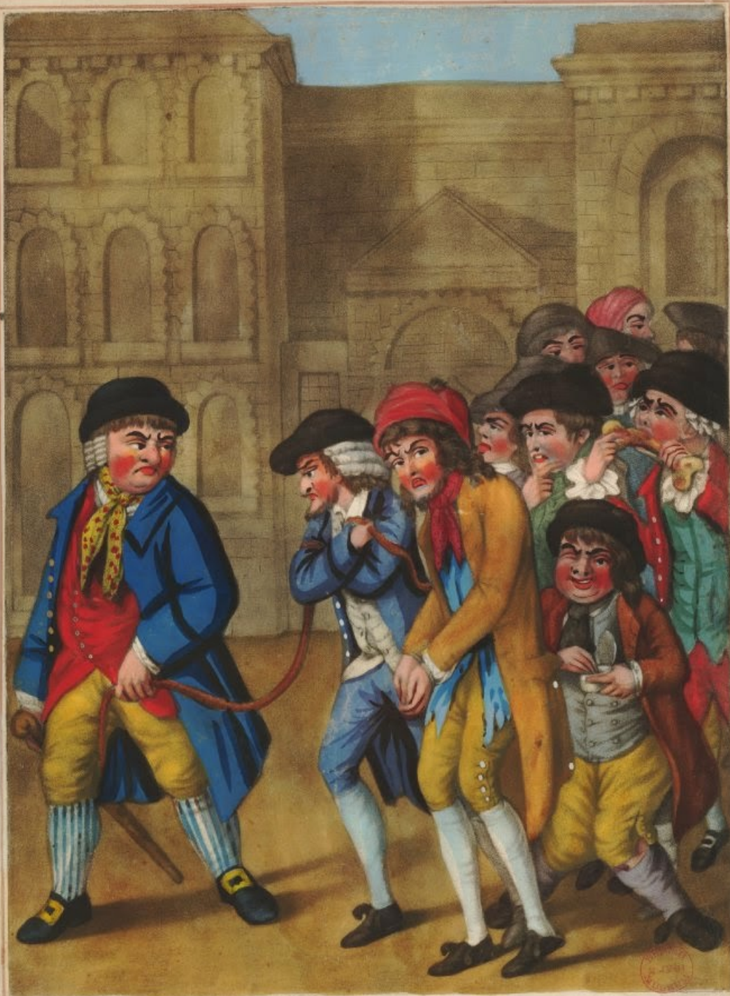
A FLEET of TRANSPORTS under CONVOY.